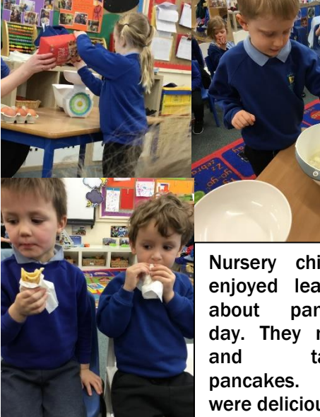
Nursery children enjoyed learning pancake day. They made tasted They were delicious!

Year 2's assembly on 14 th February was fabulous. They made Valentine necklaces to give to someone special to them.